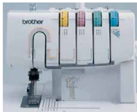
Easy to follow lay-in threading and Colour-coded threading guide