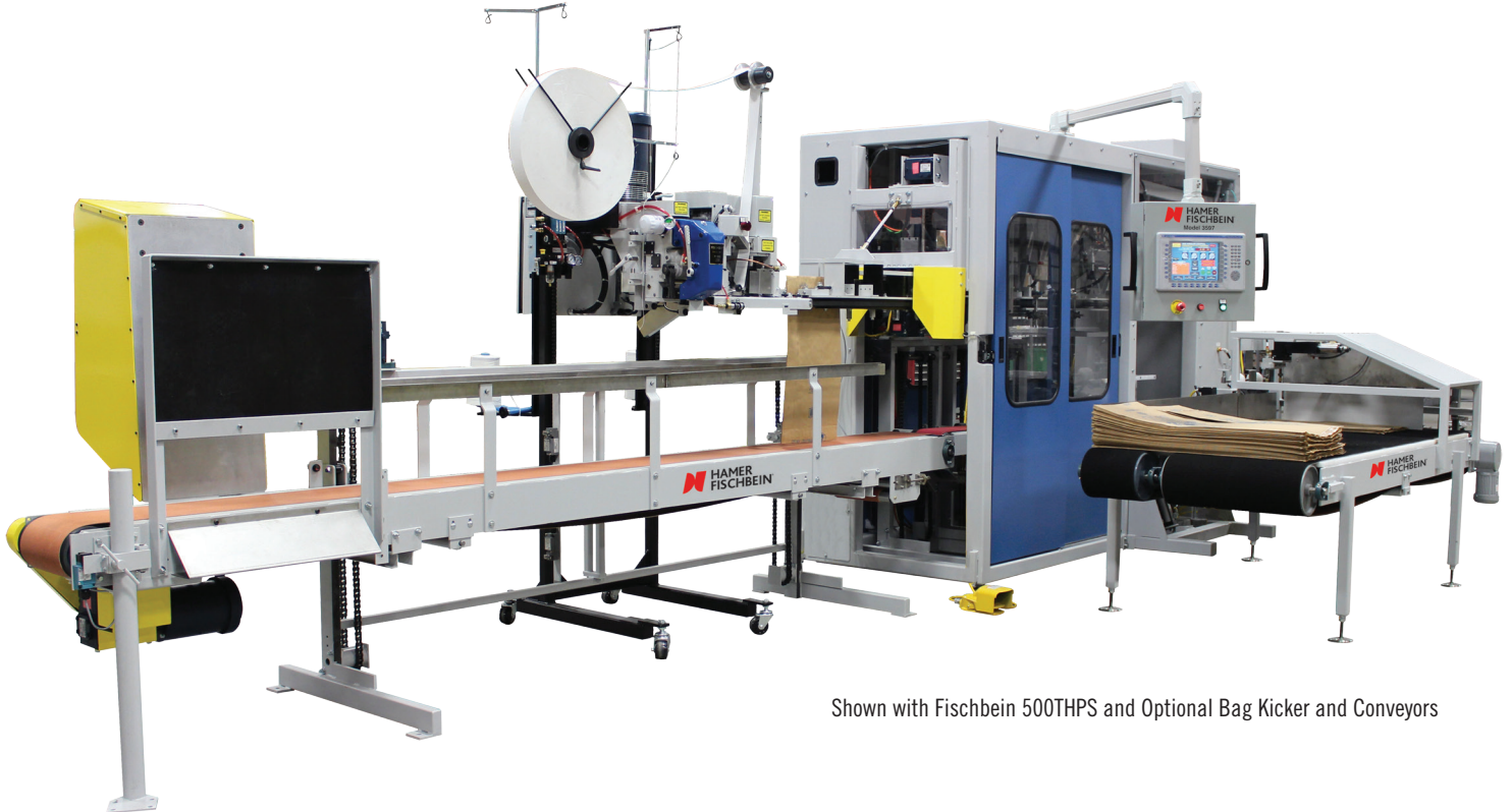
Shown with Fischbein 500THPS and Optional Bag Kicker and Conveyors

When integrated with an electronic net weigh scale, the Model 3597 automatically picks and positions the empty bag on the filler spout, fills the bag with weighed product, and immediately directs the filled bag to the bag closing station. The Model 3597 is capable of handling flat or gusseted, multi-wall open mouth paper, plastic, poly, and laminated woven polypropylene bags, as well as all forms of pinch bags.